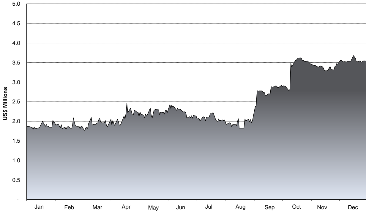
Trading Value-at-Risk daily development

The daily trading profits and losses during the year ended 31 st December 2018 are summarised as follows:-